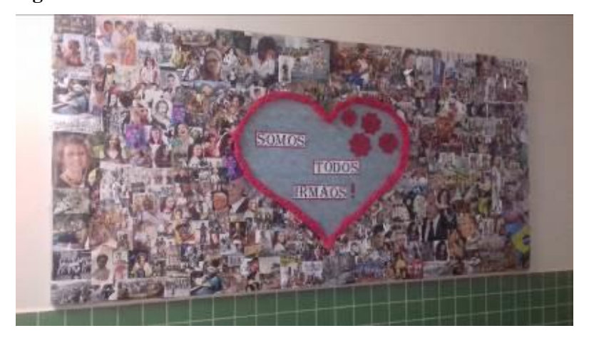
Figure 2. We Are All Brothers and Sisters