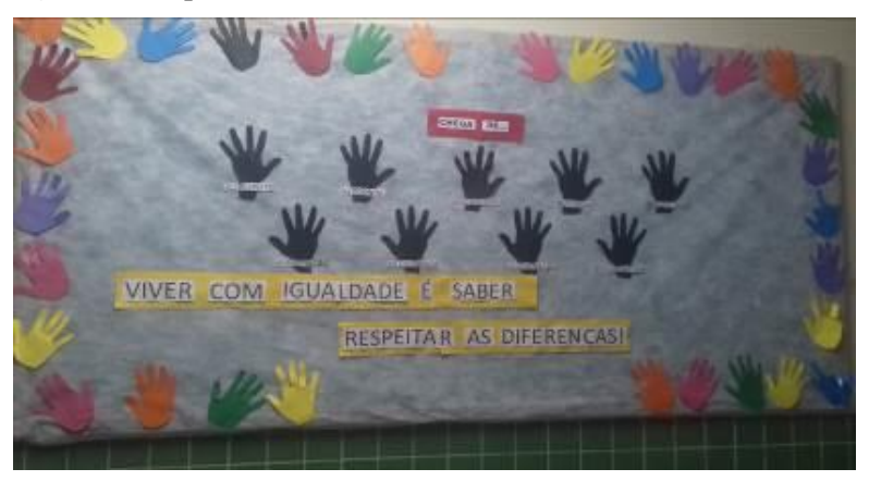
Figure 4. Respect for differences