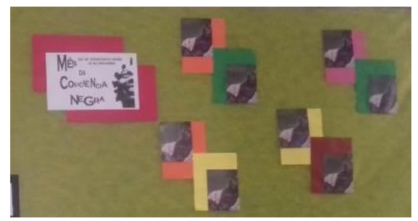
Figure 1. Black Awareness Month