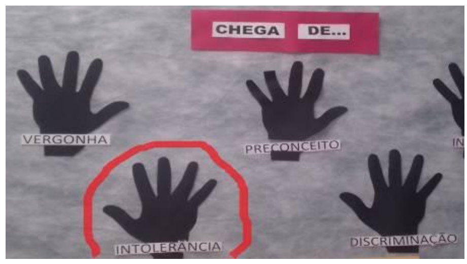
Figure 3. Tolerance discourse