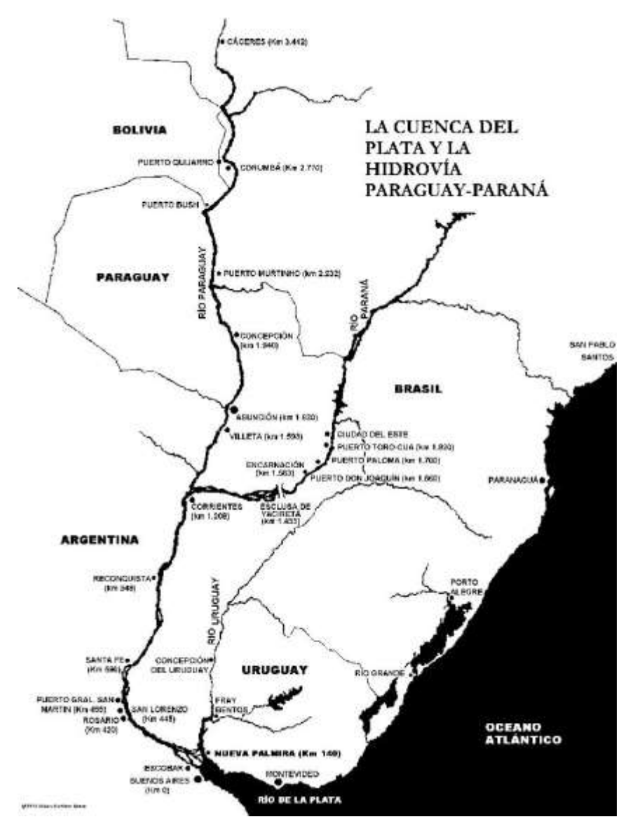
Figure 1. The Paraguay-Paraná waterway

environmental advantage.<sup>5</sup> Mercosur's waterway use increased from almost 1 million tons in 1991 to nearly 15 million tons in 2008, a compounded average annual rate of 17.2 percent over that period (IIRSA, 2008). The ratio of waterway use to intra-region trade increased from less than 7 percent in 1991 to approximately 14 percent in 2008.<sup>6</sup>