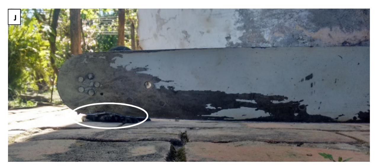
Figure 1. Conservation conditions of chainsaws regarding general maintenance (A, B, C, D); chainsaw without manual chain break and front hand guard (E); lack of chain catcher pin (F); lack of safety throttle (G); air filter needing a cleaning (H, I); worn saber (J)

The correlated variables foreseen in this study through the canonical method showed a significance of 57.70% for operators who were not trained to handle their machines, but confirmed performing the tree-cutting operation. This factor can explain the information that 20 farmers attested having suffered accidents in the operation of chainsaws and that they did not carry out the proper training required by the standard.