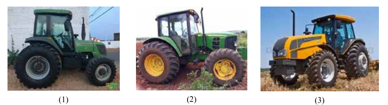
Figure 1. Tractors evaluated in this study, where: (A) Agrale BM110; (B) John Deere 6100J; and (C) Valtra BM100R

To evaluate the assess to the workstation, the following variables were measured: position, step size, height of the first step to the ground, distance between steps, depth of steps, height and width of the access door to the cab. The measurements were performed according to the parameters specified in Figure 2.