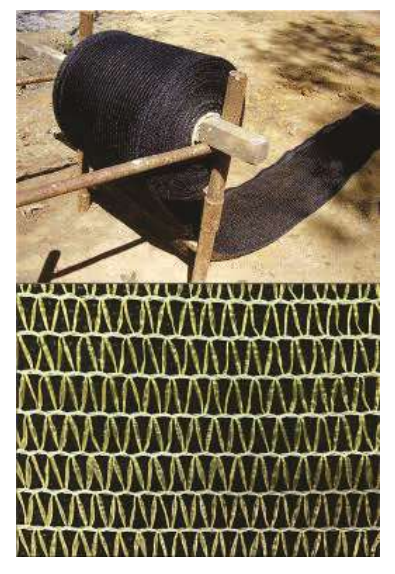
Figure 1 – Biopack roll (above) and the high-density polyethylene mesh in Raschel mesh (below) sold by Citropack ©.

The hyperadobe is a modality of BEC, derived from an exchange of bags used, being considered the most recent evolution of BEC. The improvement was proposed by the Brazilian engineer Fernando Soneghet who in 2006, working in partnership with the company Citropack ©, changed the type of bags used replacing the continuous woven polypropylene bags (PP-T) - used until then for BEC in the modality of superadobe - by continuous bags of high-density polyethylene mesh in Raschel mesh (HDPM-RM) as seen in Figure 1, calling this evolution hyperadobe. (SANTOS, 2015) The new bags are commercialized by Citropack © by the name of biopack (CITROPACK).