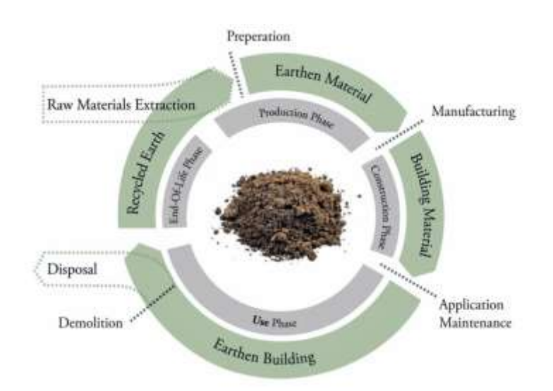
Figure 3 – Earthen building materials and methods - Life cycle diagram of earth as a building material.