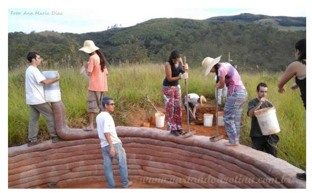
Figure 2 – Construction with hyperadobe - bag filling (workers on the left) and on-site compaction (on the right).

The construction system is simple to execute and consists of filling in continuous bags in loco with the soil, and its horizontal and vertical compaction, row by row, to build the walls as monolithic blocks, as seen in Figure 2. With hyperadobe the structures built can be made of straight-line walls, curve walls, or domes.